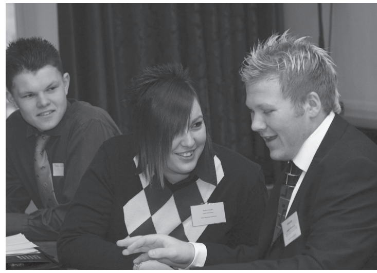
that it is my right to be involved in making decisions, planning and reviewing an action that might affect me. Having a voice, having a choice."

In 2004 the Participation Project in the Assembly ran a competition to produce a national definition of participation that would be easy to understand for adults and children and young people. The winning 'sound-bite' was: "Participation means